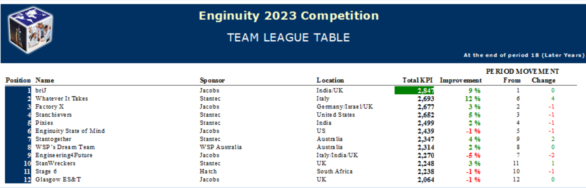
The Final League Table